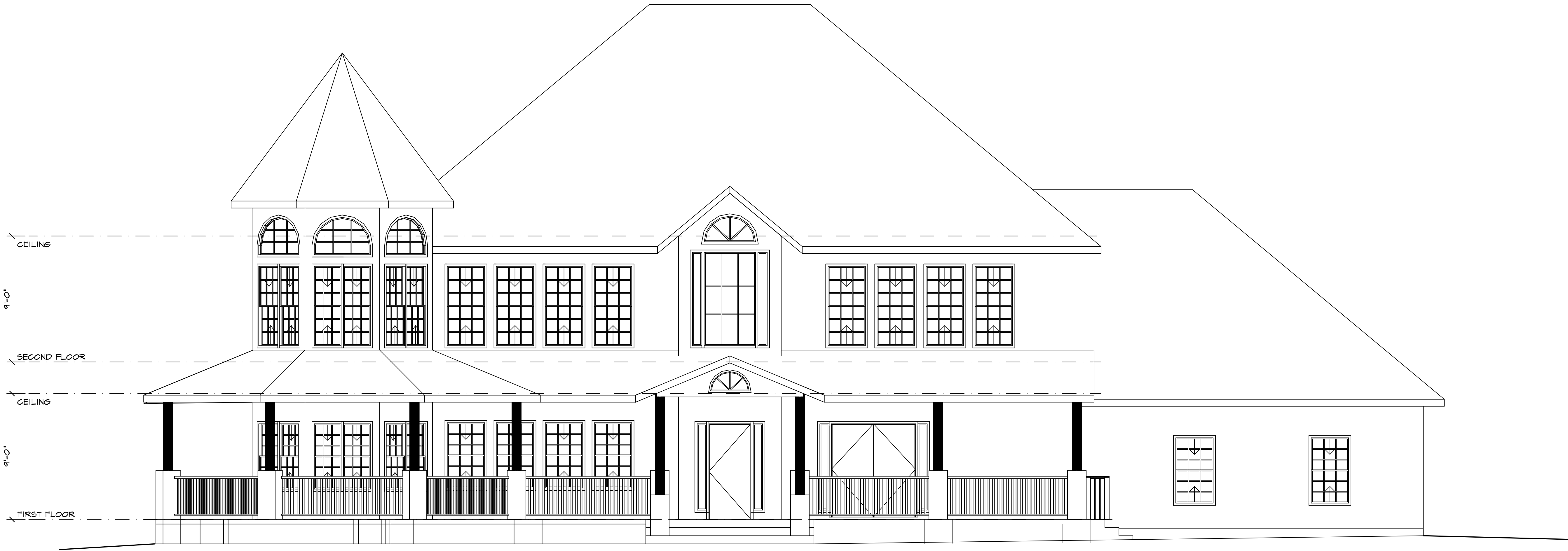
A SOUTH ELEVATION SCALE: 1/4" = 1'-0"