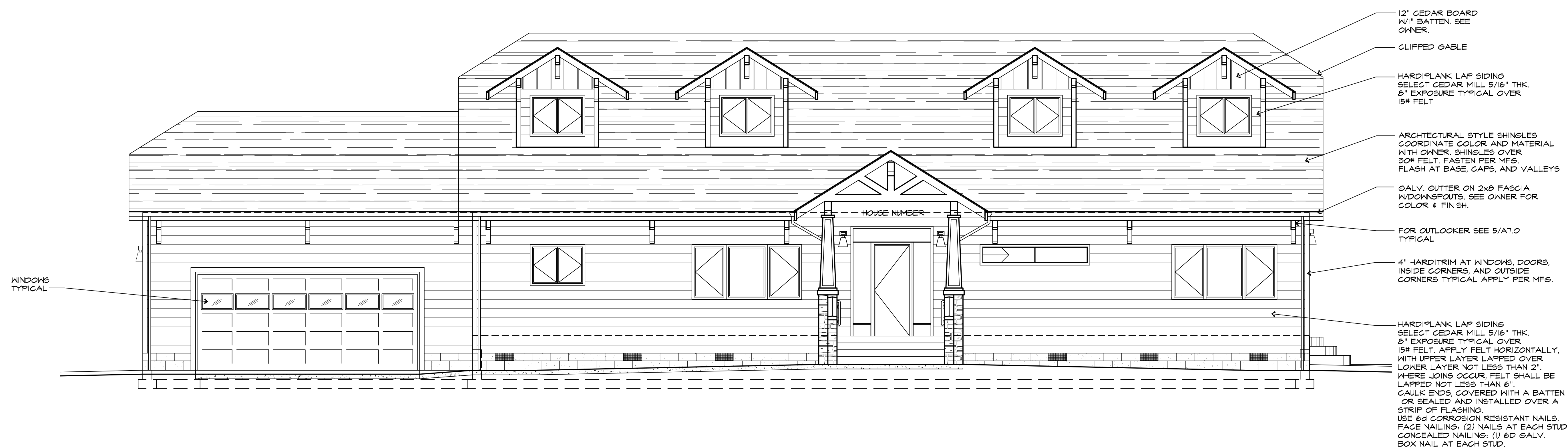
NORTH ELEVATION SCALE: 1/4" = 1'-0"